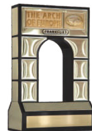
International Arch of Europe Award 2012 Germany for Quality & Technology in Gold Category