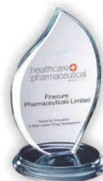
Healthcare & Pharmaceuticals Awards UK-2015