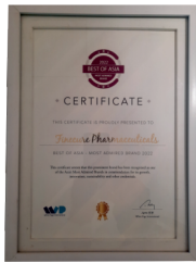
Best of Asia Most Admired Brand by White Page International-2022

Finecure Pharma is recognized in the Best Healthcare Brands 2023 by The Economic Times. Our mission has always been to deliver excellence in healthcare, and this recognition reaffirms our dedication to that goal.