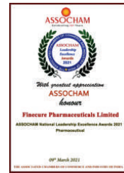
Assocham National Leadership Excellence Awards 2021 Pharmaceuticals