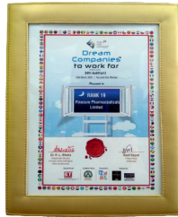
Dream Companies to Work For-19th Rank, World HRD Congress 2022